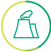
Smoke or airborne irritants